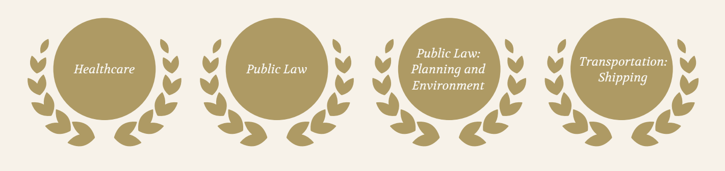
The following practice groups received the highest ranking:

Chambers Europe 2022 recommends AKD in the following areas: